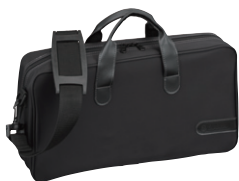
Case and Case cover for YCL-650

All Yamaha B \flat and A clarinets are available with an E \flat lever.