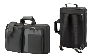
Case and Case cover for YCL-SE ARTISTMODEL-A