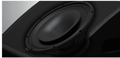
15" coaxial driver

*DHR12M and DHR15M feature a 1.75" coaxial compression driver.