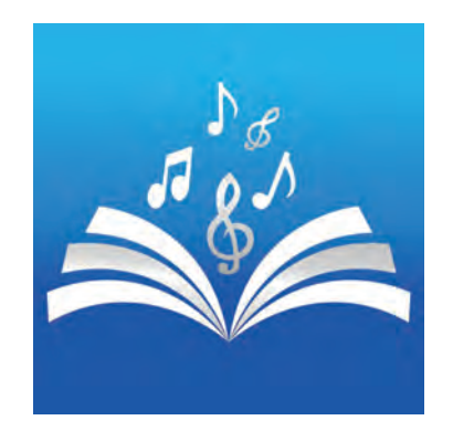
For more information, visit http://baum-software.ch/en-songbook.html

SongBook+ is the fit-for-stage app for iPad that allows you to have your songs with lyrics, music notation and more on hand when performing. With Genos it's very easy to link the selection of a song on iPad to the corresponding registration on the keyboard and vice versa. SongBook+ has received many positive reviews from enthusiastic musicians.