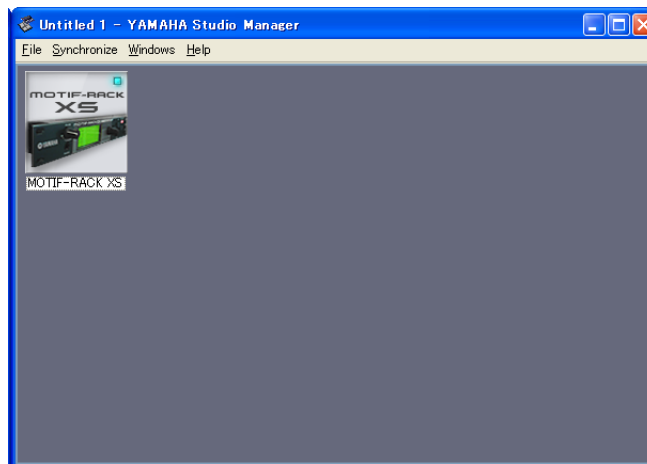
Studio Manager window

In the Studio Manager window, double-click the icon for the MOTIF-RACK XS Editor.